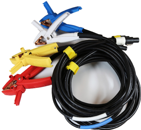
32 A X leads TAU3 PRO, TAU3 EXP