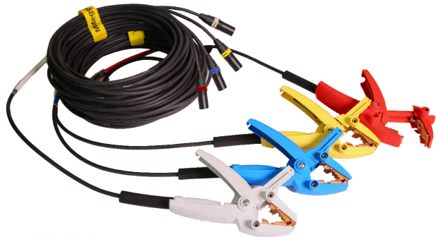
16 A X leads TAU3 BASIC, TAU3 ADV