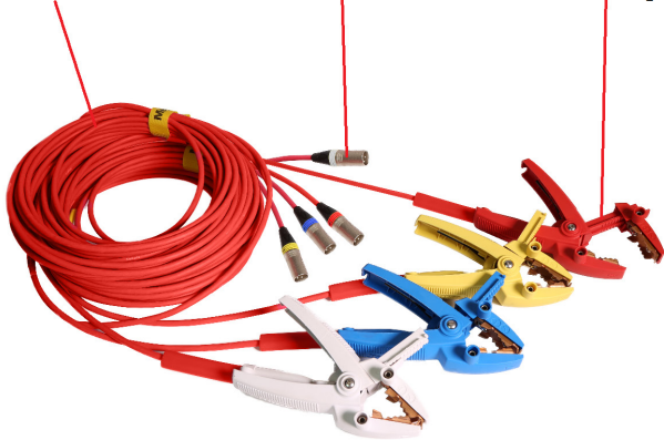
16 A H leads TAU3 BASIC, TAU3 ADV, TAU3 PRO, TAU3 EXP