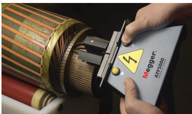
The ATF5000 armature test accessory makes testing armatures with many coils and commutator segments easy and fast

The PPX30A adds armature test functionality to the 30kV power pack, allowing rapid and efficient testing of large DC motors.